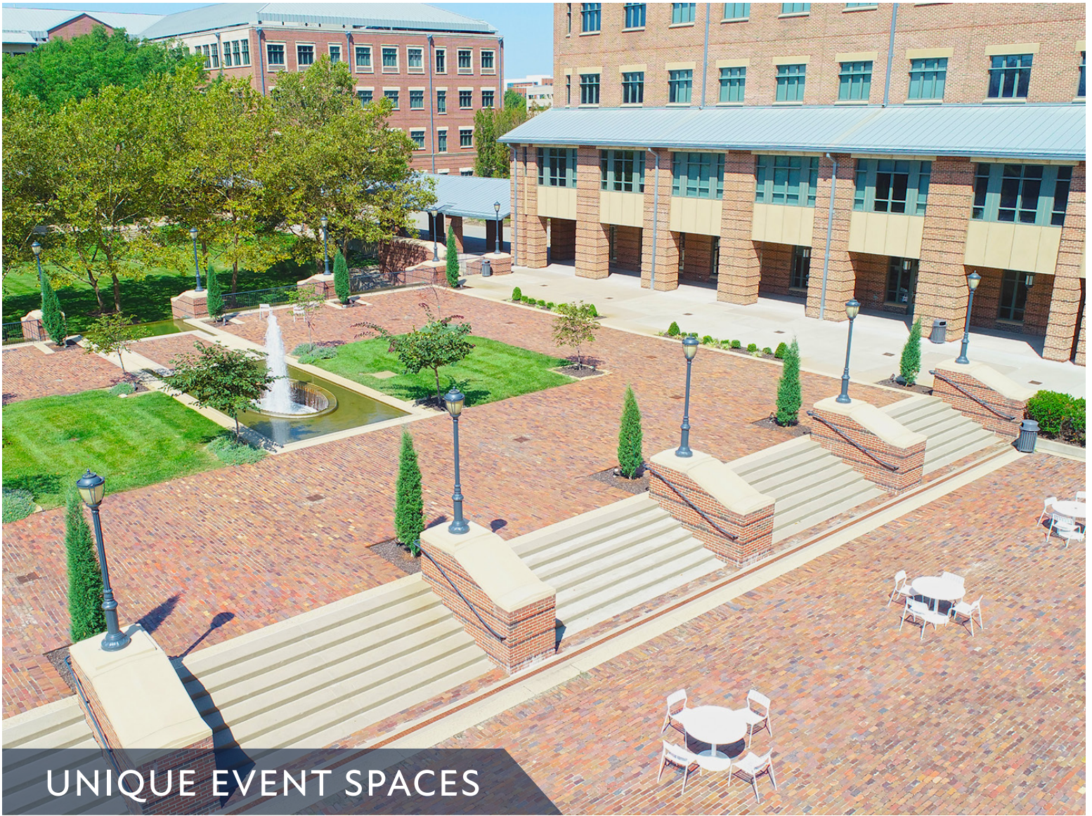
UNIQUE EVENT SPACES